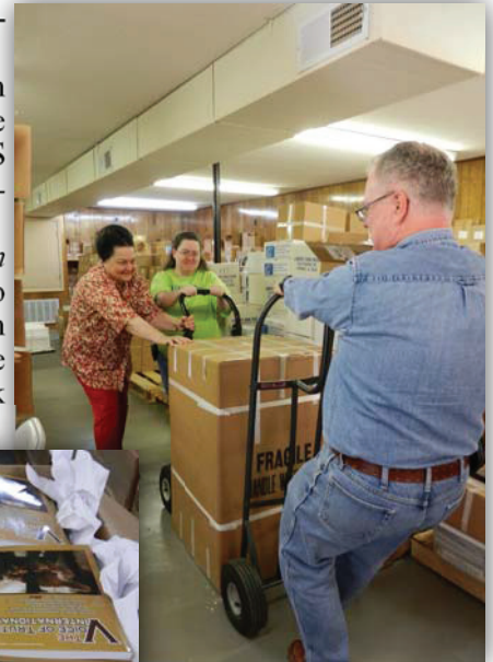
1,820 loose copies of The Voice of Truth International make for a 520 lb. box. We’re not likely to do that again!